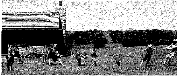
Family Fun Day